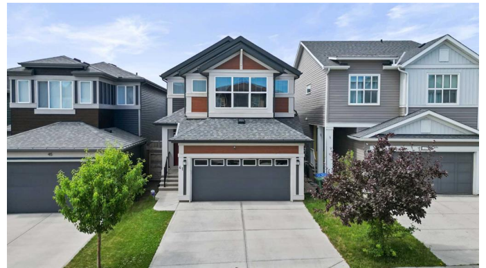
41 SETON GROVE SE R.F.C.A. MEASUREMENT STANDARD - CALGARY, AB MAIN LEVEL (AG) - 1008.90 Sq Ft / 93.73 m 2 UPPER LEVEL (AG) - 1329.52 Sq Ft / 123.51 m 2 TOTAL ABOVE GRADE RMS SIZE - 2338.42 Sq Ft / 217.24 m 2

** Quick Possession - Move in ready ** Custom Jayman BUILT home - Award Winning Madeline 24 Model ** Family Approved ** SOUTH BACKYARD ** Extensive upgrades and superior quality, with over 2338+ square feet of luxurious Air-Conditioned living space. You will be impressed with the privacy of an oversized homesite featuring a private, south-west-facing backyard with a bespoke 10' x 10' upper deck and a lower 18' x 11' concrete patio and gazebo. Enjoy this convenient Seton Location - steps away from ponds, parks, pathways, schools, shopping, soccer fields, bike paths, transit, a clubhouse, 212 Avenue, and expressways. Rich curb appeal with architectural features - dramatic rooflines, an attached garage, and a full-sized concrete driveway, along with covered entry and columns, complete this spectacular elevation. There are extensive upgrades throughout, and the details are superb. This is a must-see home! Chefâ€™s kitchen includes quartz counter tops, custom light & dark wood style cabinets/doors, extension trims, KitchenAid stainless steel fridge/dishwasher/microwave/wall oven, 6 burner gas cooktop, recessed lighting, oversized central island, island with a flush eating bar & brown Silgranit under mount sink, walk-in 7.5' x 5' butlers pantry with storage & a large central breakfast nook. The main floor layout features an office/den, a family room with an electric fireplace and stone detail, a family-sized open foyer with a side window,