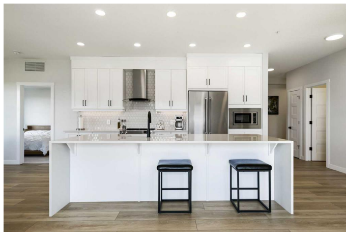
312, 55 WOLF HOLLOW CRESCENT SE REC-MEASUREMENT STANDARD - CALGARY AB MAIN LEVEL (AG) - 1134.96 Sq Ft. / 105.44 m² TOTAL ABOVE GRADE RMS SIZE - 1134.96 Sq Ft. / 105.44 m²

You know that feeling when you are on holidays? When you walk into your high end hotel room and take a big deep breath and then a huge sign of contentment resting your gaze on immaculately maintained and gorgeous surroundings? Then you take a step out to your over sized and spacious balcony to sit down and enjoy the golden hour and wonderful view, all the while thinking...I could live here. Well...here's your chance! Welcome to the Bow360 at Wolf Willow where you are invited to explore almost 1200sqft of luxury living. This stunning CORNER UNIT overlooking the greenspace and park will invite you in and have you feeling like you are in vacation mode immediately upon entering. The 9ft ceilings and spacious foyer opens up to a thoughtfully designed open floor plan that introduces you to TWO BEDROOMS plus DEN complimented with 2 FULL BATHS showcasing stunning black hardware with a professionally designed interior colour palette. Designed by award winning architects S2 you will enjoy the expansive living room with beautiful feature fireplace with floor to ceiling stone and luxury vinyl plank flooring through out the main living and designated dining area which is situated overlooking the deck and greenspace. Corner lot window treatments gives you additional over sized windows that are framed in by custom window treatments and the radiant heating keeps you nice and cozy during the cooler months while the central air vented through out the entire unit