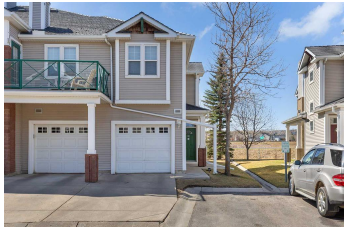
39 Hidden Creek Pl NW #304

Welcome to this beautiful end-unit in Hidden Valley's Hansen Creek Manor! West Backing onto a beautiful nature reserve with a freshwater pond and nestle in very conveniently located in a sought-after community of Hidden Valley NW. This single front attached garage townhouse is idle and perfect for those attempting to downsize into a quiet living space, surrounded by a welcoming neighbourhood with exceptional scenery and many walking paths. Also good for First-Time Home Buyers or investors to live or grow their equity. This home offer you ground floor single attached garage parking and 2nd floor quite living with the beautiful views from spacious and bright living room with cozy fireplace and dining. A very Bright and open concept floor plan loaded with two bedrooms and two bathrooms, open kitchen and dining, multiple pantries and closets. A big master bedroom with 4 pcs ensuite allow you to have your sound sleeps quietly. When the living room off the patio door the huge and sunny deck welcome you for the more sounding nature views and warmth for your summer BBQ to you and your guests. This home is very conveniently and closely located to the Schools, Gas Station, Small plaza with restaurant and other. Also only 2-5 minutes drive to Creekside Shopping Centre. A very easy and quick access to the STONY TRIAL allow you to drive to BANFF, EDMONTON and City-Centre wherever you want to. This home comes equipped with a stairlift for