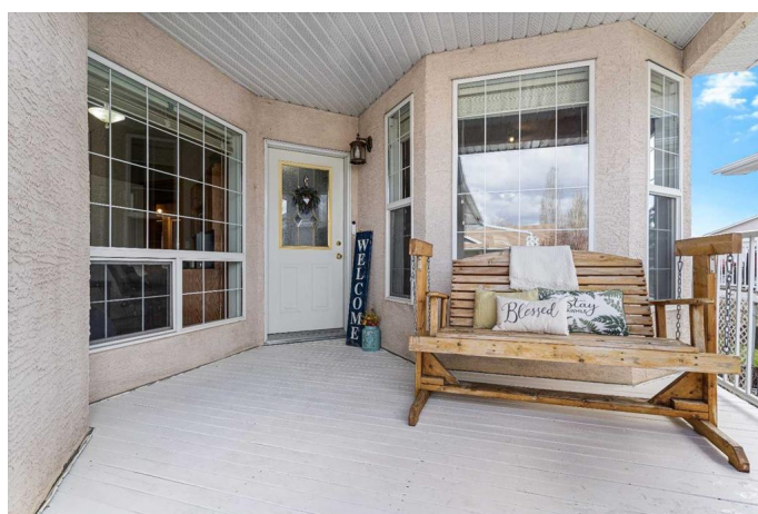
533 Lineham Acres Dr NW, High River, AB

Main Building: Total Exterior Area Above Grade 1269.38 sq ft