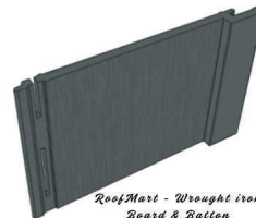
RoofMart - Wrought iron Board & Battan