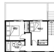
UPPER FLOOR PLAN UPPER FLOOR AREA: 349 SQ. FT. 2 BEDROOMS | 1.5 BATHS 949 SQUARE FEET