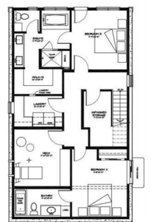
LOWER FLOOR PLAN (optional) DEVELOPED LOWER: 850 SQ. FT.

The Developer reserves the right to make modifications or substitutions to building design, specifications and floorplans to maintain the high standards of this project. Square footages are based on preliminary architectural measurements and may be subject to change. E & O.E.