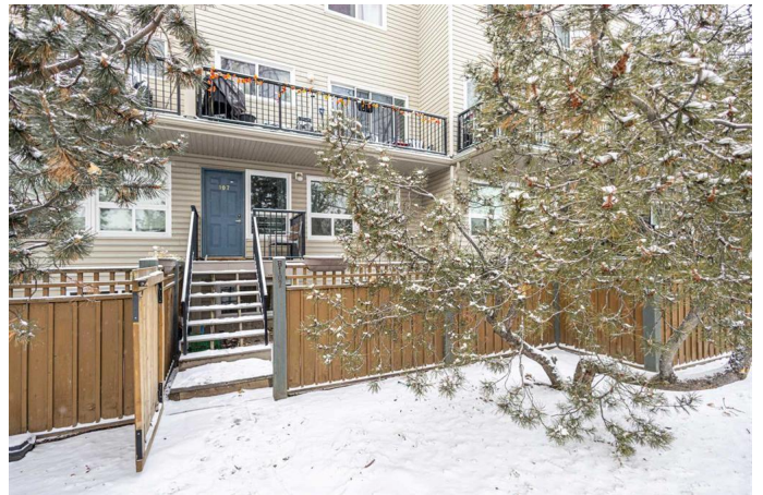
107-3615 49 St NW, Calgary, AB

Main Building: Total Exterior Area Above Grade 404.85 sq ft